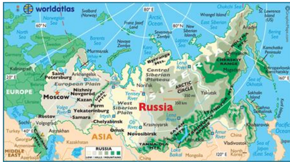
Figure 2: Map of Russia. World Atlas. Russia Map. http://www.worldatlas.com/webimage/countrys/asia/ru.htm (Accessed July 22, 2014).

Many drug users in the region prefer to inject Afghan heroin or inexpensive opiates such as poppy straw that is easily grown within surrounding countries. Poppy straw is grown in the region year round, however it is much more scarce in the winter months, leading drug users to seek other drugs or ways to traffic poppy straw across borders. Poppy straw, also known as the poppy capsule, refers to the entire dried poppy plant other than the stem. Nearly all of the opium contained in poppy plant is contained in the straw, which includes the seeds. 11 Opium may be extracted from the plant for purposes of smoking, injecting, or manufacture into heroin.