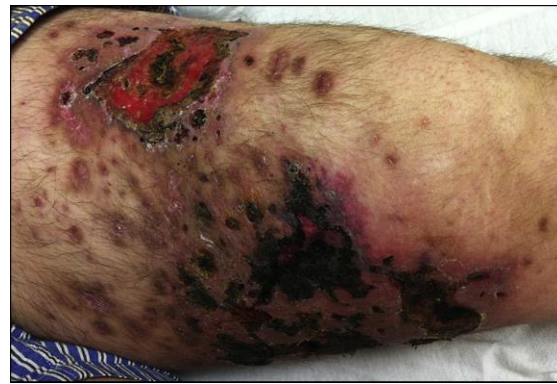
Figure 3: Necrotic ulceration of left thigh. Image originally reported in 17 and reproduced with permission of Elsevier.

It is estimated that approximately 100,000 people in Russia and 20,000 people in Ukraine use Krokodil. 15 Although Krokodil usage has thus far only been reported in Europe, a case report published in March 2014 suggests the need for physicians and other healthcare providers to be cognizant of the possibility that Krokodil or other homemade heroin substitutes are likely making their way into the United States. 16 The report describes a 30 year-old male who presented to a hospital in St. Louis, Missouri with pain, swelling, and ulceration of the left thigh. He reports that he's been using Krokodil for the past 6-7 months and initially noticed blisters which rapidly turned necrotic and reports auto-amputation of his left little finger.