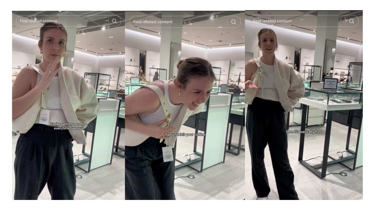
Figures 3, 4, & 5. Tiktok user @caitlinwiig

in the "girl math" trend allows women to feel seen by others who resonate with it as "universal experience" and "lifestyle" shared amongst women.<sup>20</sup>