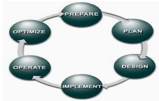
Fig.1” PDIOO Model”