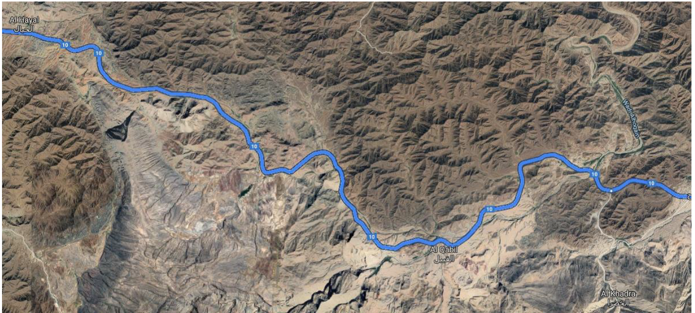
Figure 1. The huge mountains and curves in Rustaq-Ibri road